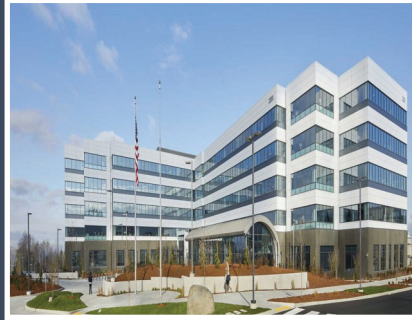
FAA NW Headquarters Seattle, WA