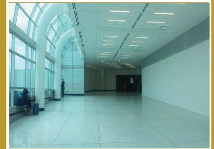
Charlotte Douglas International Airport, Charlotte, NC