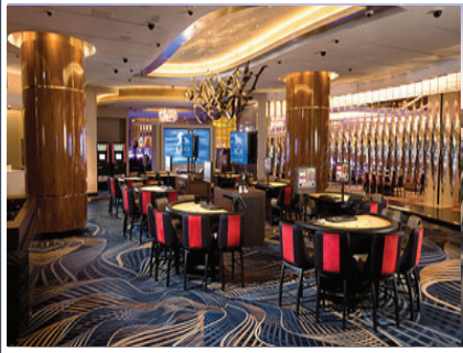
MGM National Harbor Oxon Hill, MD