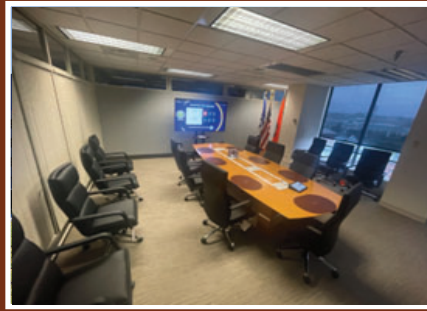
FAA Headquarters, Washington DC