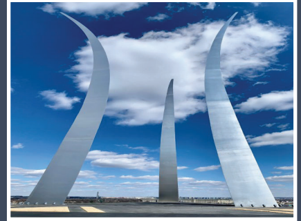
US Air Force Memorial Washington DC